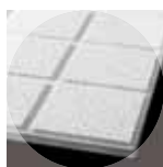
FINE FISSURED Second Look IV